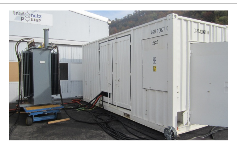
Our LFH plant connected to a 2 MVA transformer

El. connection: 3*400V / 200A Frequency range 0.001-1.5 Hz Installed in a 20' container Manufacturer: ABB Micafil